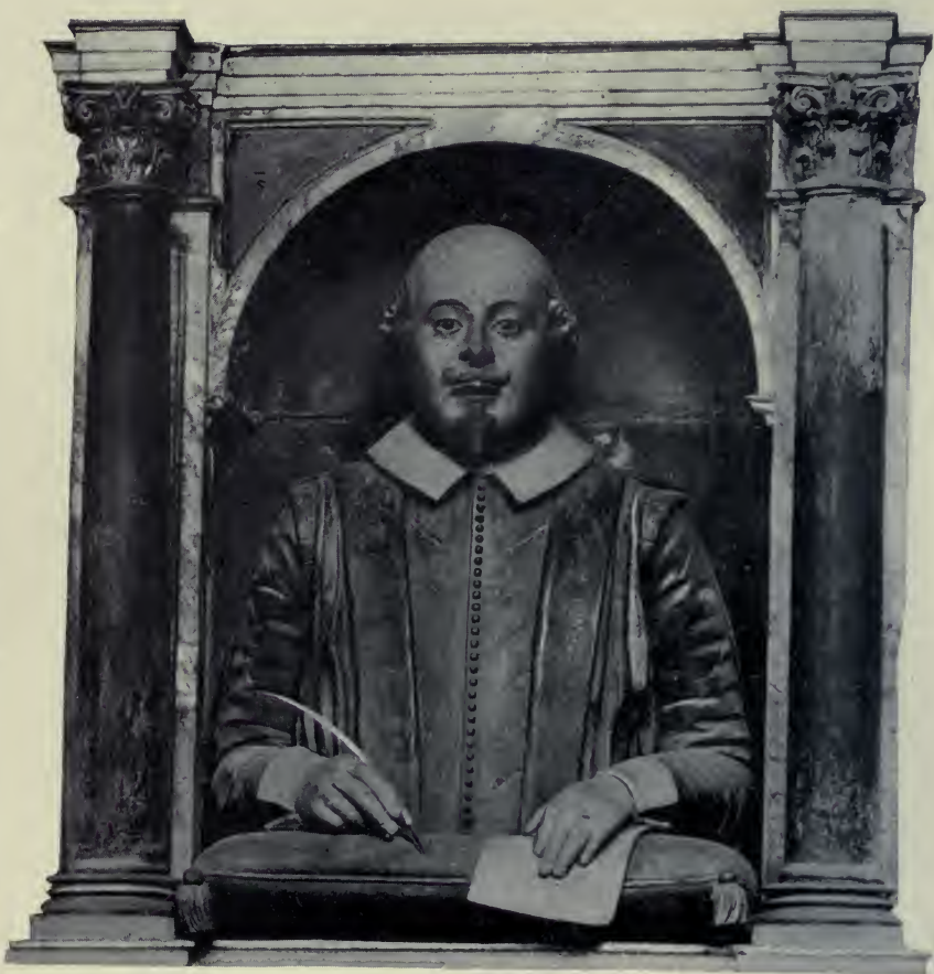
THE STRATFORD BUST

LOOK HERE, UPON THIS THE COUNTERFEIT PRES