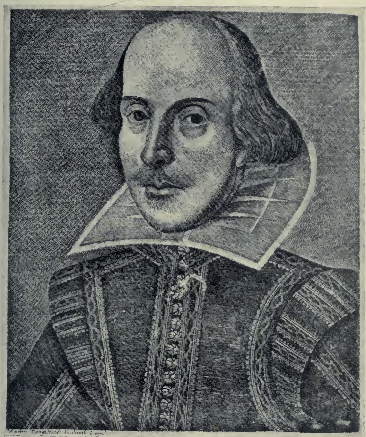
THE DROESHOUT ENGRAVING