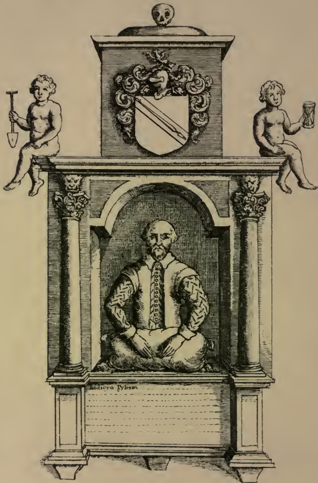
The Earliest Presentment of the Stratford Bust. as it was seen by Sir William Dugdale about 1636. (see p. 246)