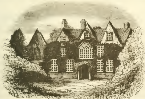
RALEIGH'S HOUSE, VOUGHAL.

in Charles I. the false, Charles II. the bestial James I. "learned fool," 4th George ———. There was that in Elizabeth one could bend the knee to with self-respect. Even in her "old age" the very largeness of the ruin was declarative of the primary grandeur. In those—it is to worship the man, however base, as it is to caricature "the divinity that doth hedge a king," to hold the sentiment noble when cherished toward them and the like, and blasphemy when held towards Elizabeth, Oliver Cromwell, William III.—the more that the solitary excuse for the Stuarts is the incense of adulation that bishops and ministers of State ceaselessly offered them. I protest with all my soul against any charge of "shameless, lying flattery" as applied to the heart-felt homage and reverence and pride in a great woman and queen of Edmund Spenser and his associates.